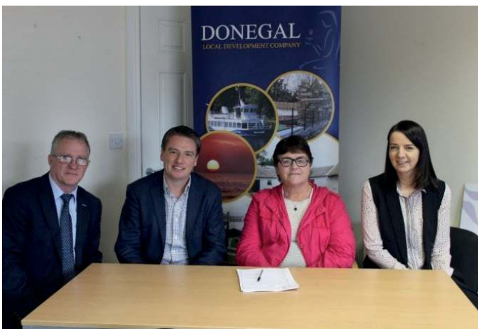
Donegal Local Development CLG (DLDC)

(Wexford LCDC) for eleven niche food and beverage businesses located throughout the county. This grant aid is anticipated to result in the creation of up to twenty-five new full-time jobs and fourteen part time jobs in the county over the next three years. For further information on LEADER funding in your local area, including how to apply, please contact your Local Action Group. A full list of LAGs and Implementing Partners can be found on the LEADER section of the NRN website: http://www.nationalruralnetwork.ie/leader