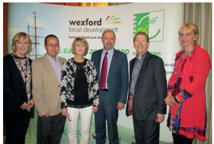
Wexford Local Development (WLD)