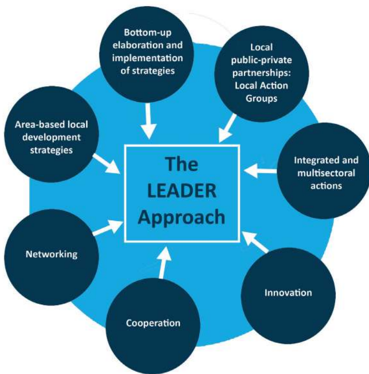
A detailed description of these 7 key principles of LEADER can be found here: https://ec.europa.eu/agriculture/sites/agriculture/files/publi/fact/leader/2006_en.pdf

The LEADER approach is based on 7 key principles – all of which must collaborate and positively interact for it to be successful. Indeed, it is important to consider these 7 principles as a toolkit, rather than as separate entities, that can work together to safeguard and build a brighter future for rural communities.